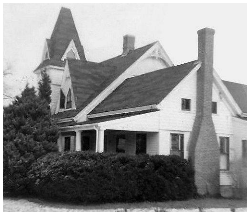
1960s image of 480 Main Street provided by the author