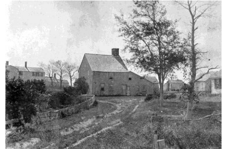
"Old Hall House, Hall St., Dennis"

Fortunately, the title of the picture sent to us provided a great place to start! The picture in the middle, "Hall House" was found in our digital archives by searching "hall house". The arrow was added to the photo at sometime in the past. I included this picture, because of the road and other houses, which helped to later confirm the location. The next picture, captioned "Old Hall House, Hall St., Dennis" was found by typing that in the search box. When I found it, I thought the one from ancestry.com was a mirror image...printed in reverse. The one from our archives had to be correct, however, as it matched the panoramic view above. Additional searching by typing "Old House" in the search box yielded the picture below. Interestingly, the front and back sides of the house are almost identical! It matched the side of the house in the picture on ancestry.com. Also of interest, the entry in the "Old House" picture is more formal than the one on the other (back) side and has "lites" above the door. There were no dates for the photos from the digital archives, but the ID of the picture of a Hall House on Hall St. seemed certain. Next, to put things in perspective and to identify, if possible, other landmarks in the photos, a 1858 map from The 1858 Map of Cape Cod, Martha's Vineyard, & Nantucket , page 60 was consulted and appears below.