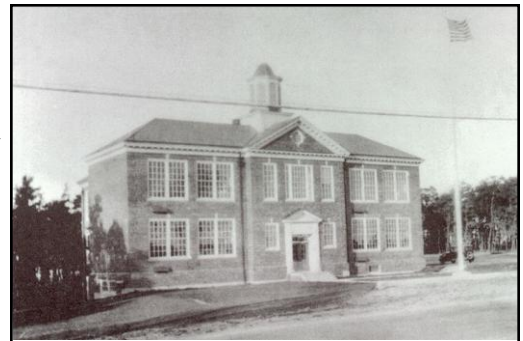
Dennis Consolidated School

At the Dennis Consolidated Elementary School we played house at recess. In the pine grove, pine needles blanketed the ground. Under the pine needles was gray, very sandy soil. We built long narrow outlines of houses with piles of pine needles. The cleared sandy soil became our house floors. Some of the houses we constructed were big enough so we could walk through the doorways. We constructed as many rooms as we wanted. We played in these "houses" until the wind scattered the pine needles. Even then we only had to repair, not completely rebuild our play houses. With a fifteen minute recess at ten a.m. and two p.m., and a longer recess after lunch, most of the girls hurried outside to play house as long as possible. The boys did not play this game. They played separately on the swing sets. Older boys played on the lower playground's merry-go-round, swing-around, and baseball field. After the 1944 hurricane the entire pine grove died, probably because of salt spray. Our fondly remembered playground pine grove disappeared.