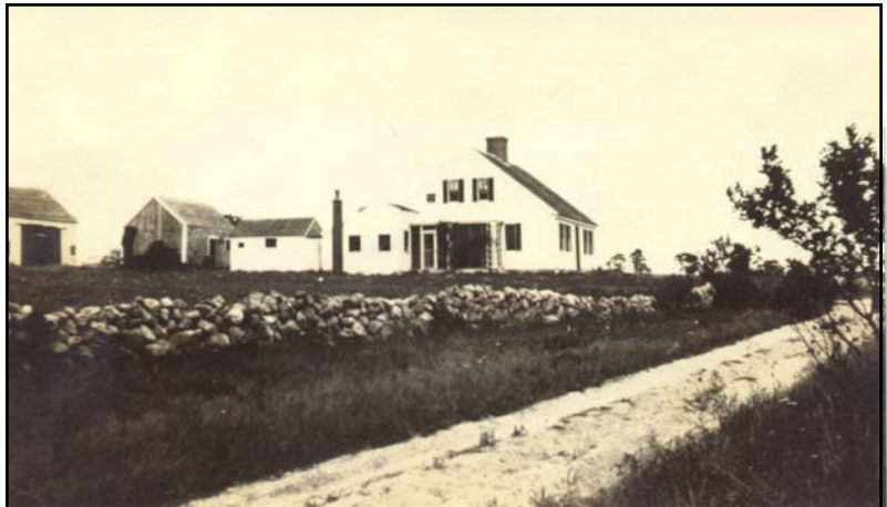
The Christopher Crowell House Old Town Lane, East Dennis