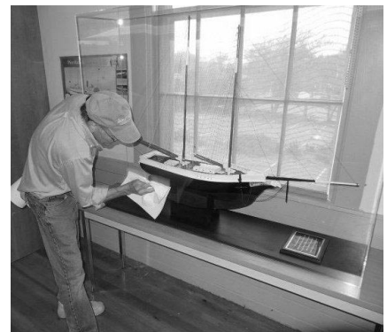
A Final Polish